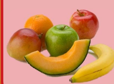
15 g carbohydrate per serving